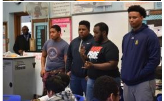
Pictured (above and left): Alumni visit classrooms at Heywood Avenue School.