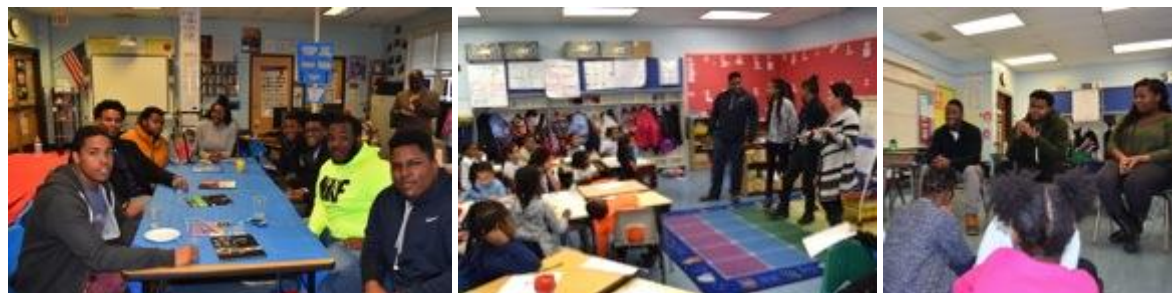
Pictured: Scenes Heywood Avenue's Alumni Day.

Fourteen alumni participated in Heywood Avenue School's Annual Alumni Day, three of whom have siblings currently attending Heywood. The alumni, who visited classes in grades K - 7, attend Montclair State University, Rutgers New Brunswick, Monmouth University, Rowan University, Union County College, Cazenovia College, Clark Atlanta University, Lehigh University, Allegheny College and Fordham University; while one is currently in the workforce with United Parcel Service (UPS). They represent the graduating classes from 2004 - 2009.