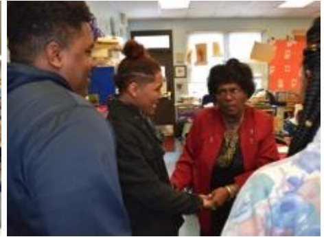
Pictured: Alumni and Heywood staff.