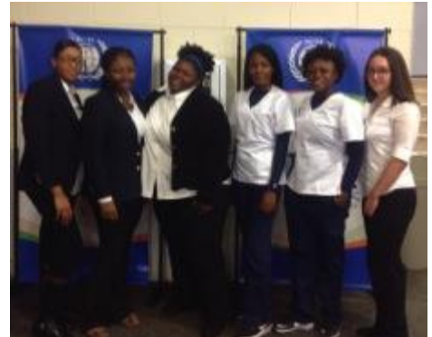
Pictured (above): OHS students at HOSA Northern Regional Competition.